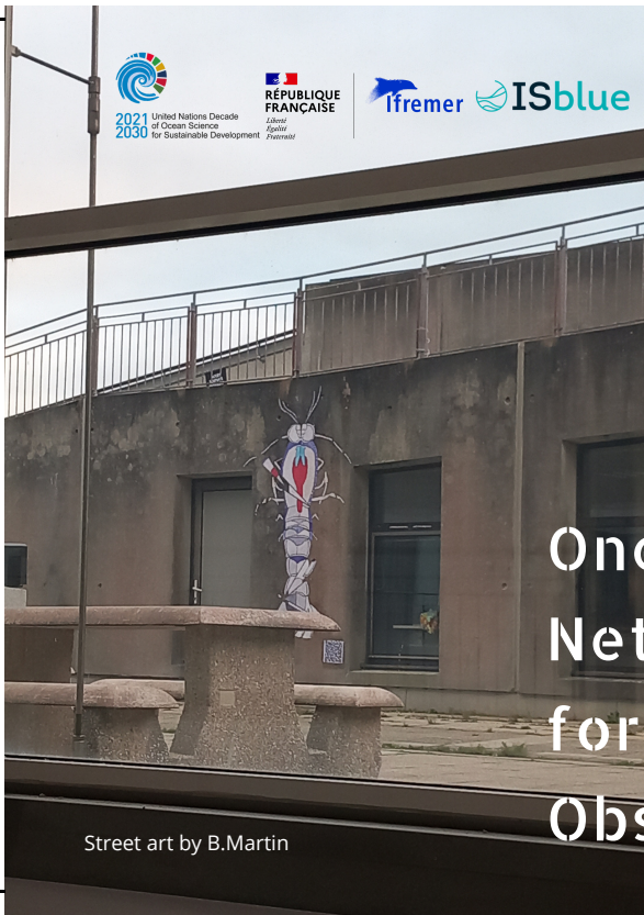
Street art by B.Martin